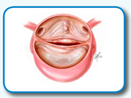
Bicuspid Valve - 2 leaflets Valve does not work perfectly and blood may flow backwards

Normal Valve - 3 leaflets Opens wide and closes securely so blood flow is normal