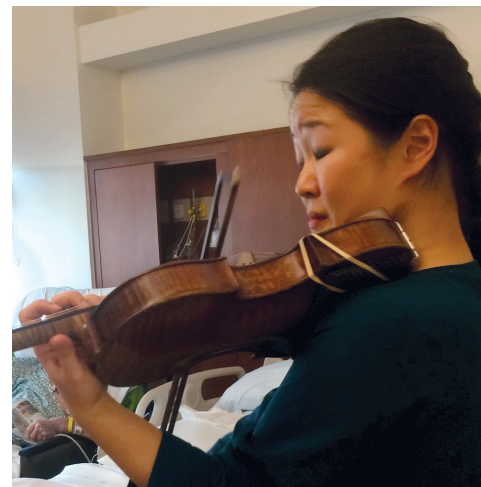
Top to bottom: Patient receiving one-on-one music therapy. Performances by the Heifetz Institute for hospitalized patients.