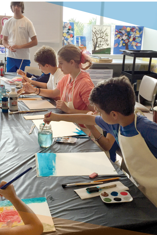
Children of cancer patients finding new outlets in the healing environment of our art therapy studio.

1 CLINICAL TRIAL is underway for art therapy to analyze its impact on the healing process.