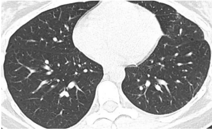
Considerations When Evaluating Pulmonary Cysts Factors to look at for disease diagnosis