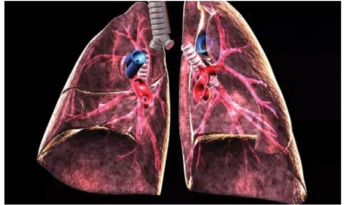
Revising the US Lung Allocation System to Improve Patient Access to Transplant Impact of the Composite Allocation Score system