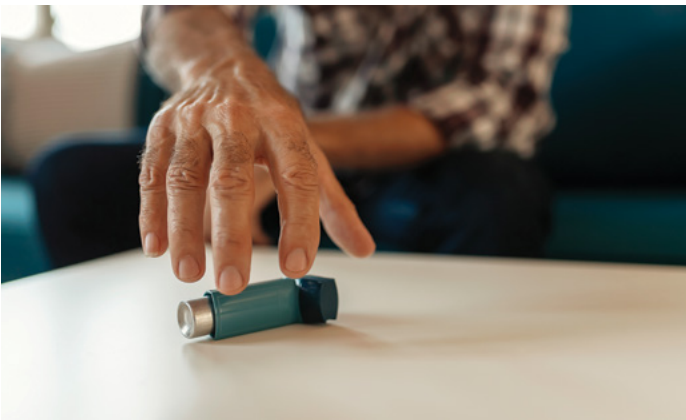
Community Lung Clinic Provides Culturally Competent Care Better support for underserved patient populations