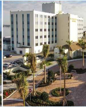
Martin North Hospital