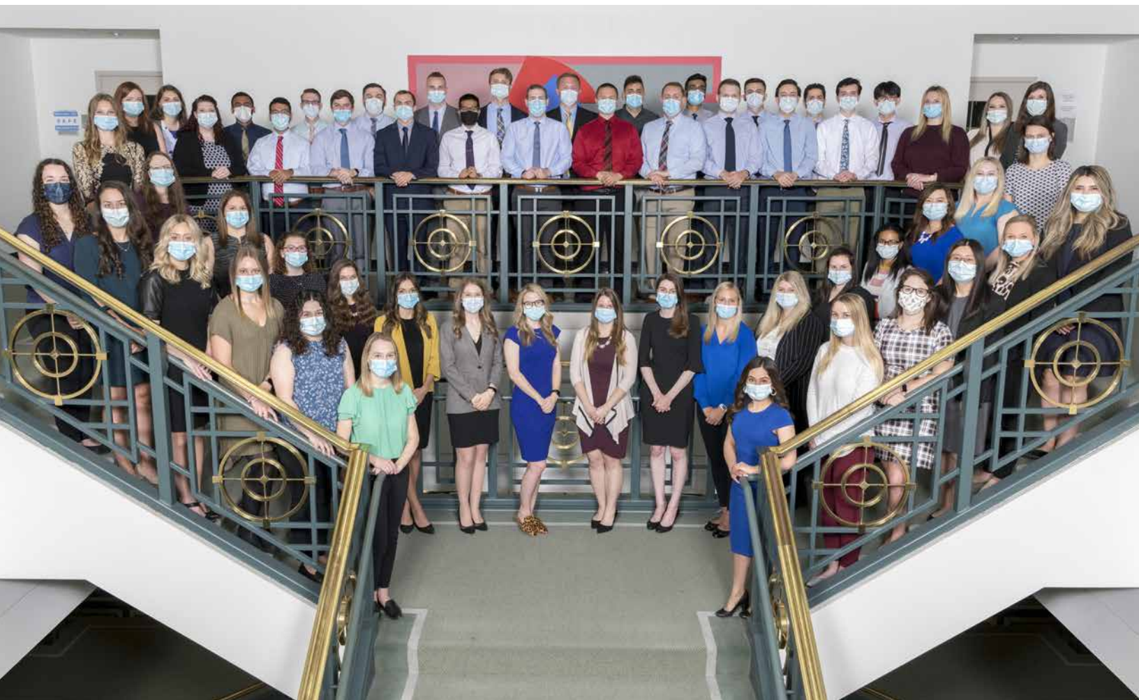
All COVID-19 required precautions were followed at the time of these photographs

PGY2 PROGRAM PURPOSE: PGY2 pharmacy residency programs build on Doctor of Pharmacy (Pharm.D.) education and PGY1 pharmacy residency programs to contribute to the development of clinical pharmacists in specialized areas of practice. PGY2 residencies provide residents with opportunities to function independently as practitioners by conceptualizing and integrating accumulated experience and knowledge and incorporating both into the provision of patient care or other advanced practice settings. Residents who successfully complete an accredited PGY2 pharmacy residency are prepared for advanced patient care, academic, or other specialized positions, along with board certification, if available.