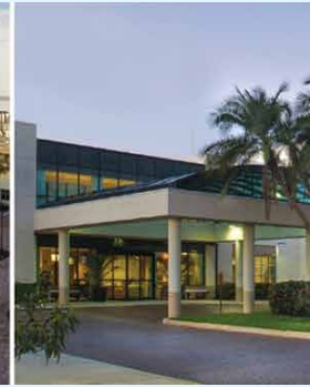
Martin South Hospital