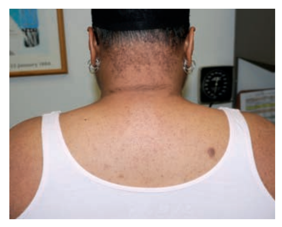
Figure 1 . A 54-year-old woman with scleredema. Indurated skin on the nape of neck, upper back and arms.

Patients with diabetic autonomic neuropathy also can experience esophageal motility disorders, but this patient had no evidence of autonomic neuropathy.