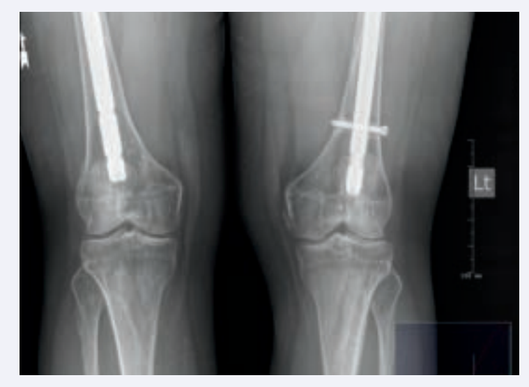
Figure: Bilateral femur fractures with rods. The knees show chondrocalcinosis.

1. Musculoskeletal pain requiring prescription pain medications, especially chronic opioids.