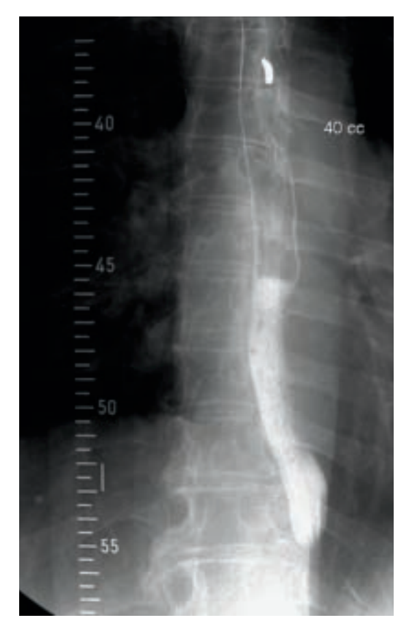
Figure 2. Standard barium swallow shows a diffusely narrow esophageal caliber. Reprinted with permission from Chatterjee S, Hedman BJ, Kirby DF. An unusual cause of dysphagia. J Clin Rheum. 2018;24(8):444-448.

This case of scleredema adultorum of Buschke is the first in the literature to exhibit severe dysmotility involving the smooth and striated muscle of the entire esophagus. More studies are needed in order to offer these patients effective therapies.