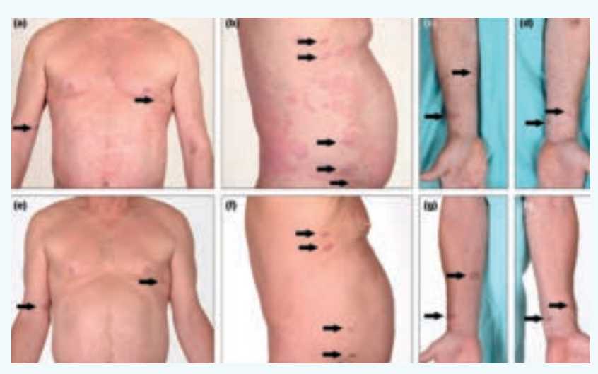
Figure. A-D. Patient in May 2016, just before initiation of ustekinumab treatment. Kaposi sarcoma (KS) lesions are denoted by arrows. E-H. Patient in September 2017, after 15 months of ustekinumab treatment. The KS lesions were unchanged compared with before initiation of ustekinumab treatment.