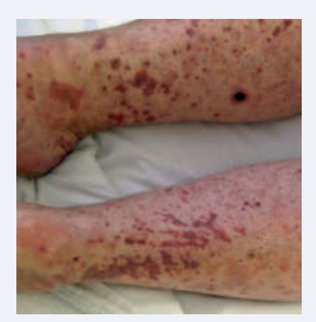
Figure 1 . Coalescing purpuric lesions involving the lower extremities in a patient with cutaneous vasculitis.

When a cutaneous vasculitis is suspected, assessment should focus on three goals: 1) rule out vasculitis that is threatening a critical organ; 2) confirm that this is