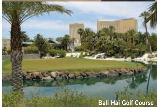
Bali Hai Golf Course