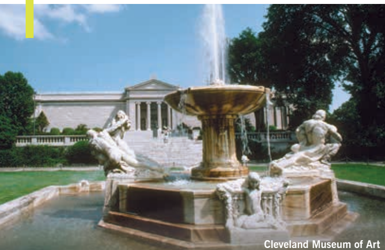
Cleveland Museum of Art

Live in a medical mecca. Enjoy the influence of a multinational city from a national rib cook-off downtown to ongoing summer festivals in Little Italy. Bike the Metroparks. Visit the Cleveland Museum of Art, the Rock and Roll Hall of Fame, or take in an outdoor concert at Blossom, the summer home of the world-famous Cleveland Orchestra. Support the slow food movement at the nationally-renowned West Side Market.