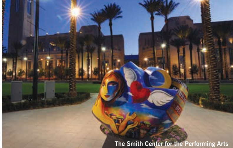
The Smith Center for the Performing Arts