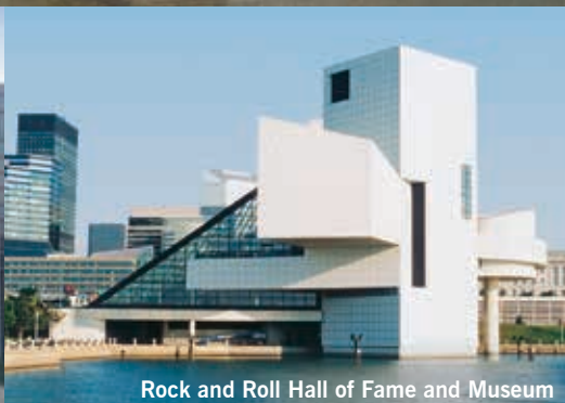
Rock and Roll Hall of Fame and Museum