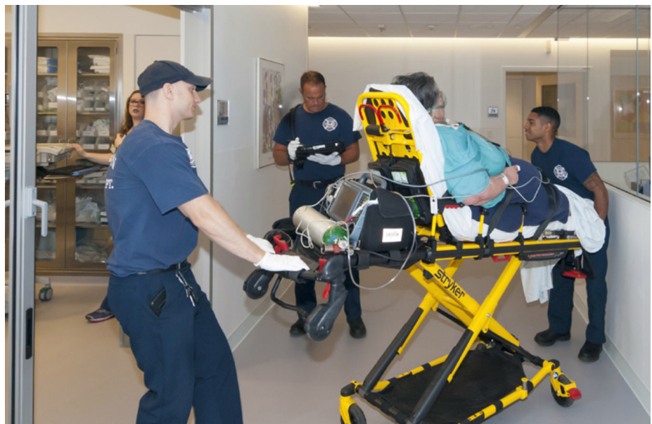
First responders providing care. Photo taken prior to 2020.

Medina Hospital Foundation funding also is important because “every agency is always trying to do more with less, and this funding allows our agencies to participate without a big impact to our own budget,” he says. “It shows us that the hospital and hospital foundation appreciate what we do and want to be involved.”