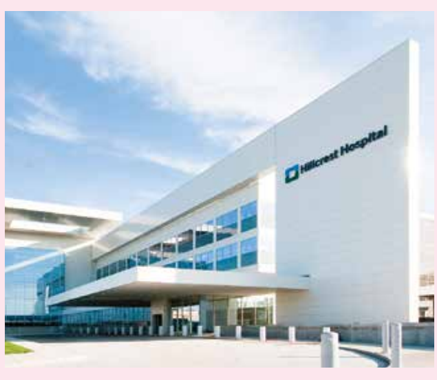
Located at 6780 Mayfield Road in Mayfield Heights, the Breast Health Center centralizes all our services, treatment programs and equipment in one convenient location.