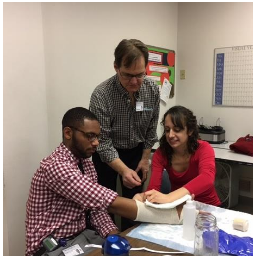
Casting & Splinting Workshop at CFM