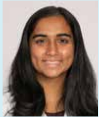
a, MD NEOMED PGY1*