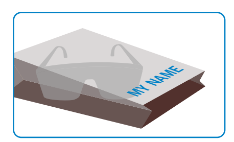
3. Allow the eye protection to dry. Re-don eye protection or store it for re-use. Label paper bag with caregiver's name.