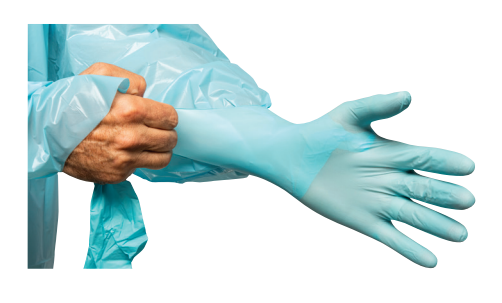
5. Put gloves on both hands, pulling them over the cuffs of the gown to cover your wrists completely