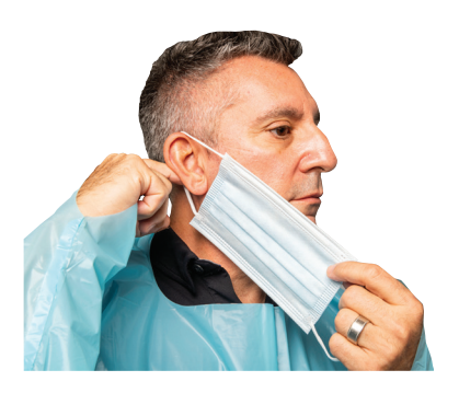
3. Take a mask and place the elastic loops over your ears

2. Put on a gown. Tie the straps in the back. (do not wrap around to the front)