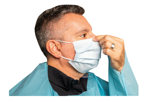
Push down on the metal band to snugly fit over your nose