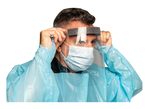
4. Place eye protection over face and adjust to fit