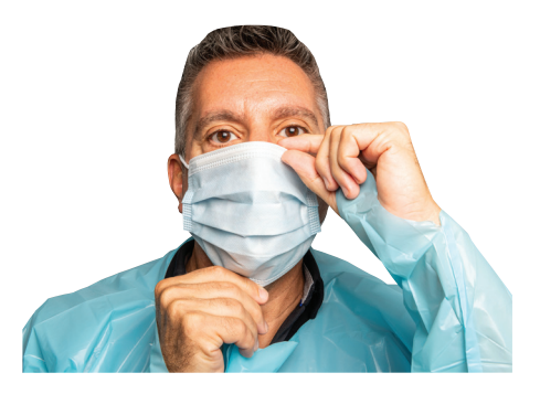
Make sure your mouth and nose are fully covered