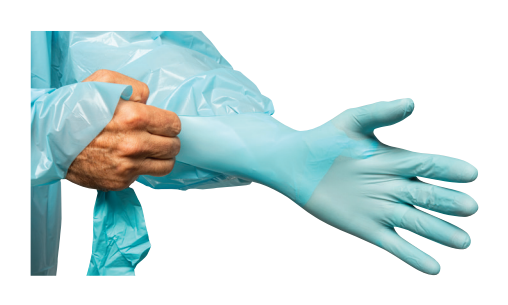
5. Put gloves on both hands, pulling them over the cuffs of the gown to cover your wrists completely