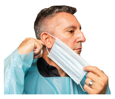
3. Take a mask and place the elastic loops over your ears

2. Put on a gown. Tie the straps in the back. (do not wrap around to the front)