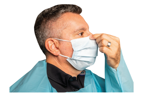
Push down on the metal band to snugly fit over your nose