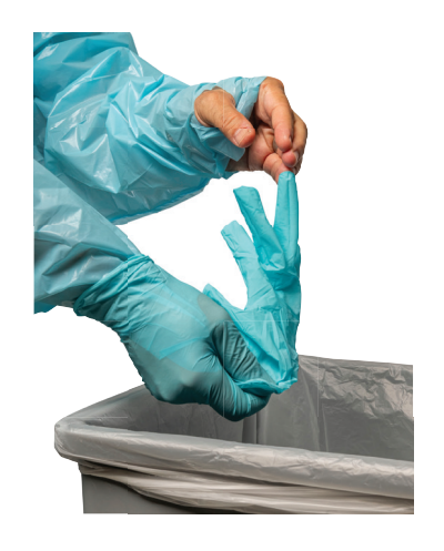
1. Remove your gloves and place in trash can. Clean your hands with hand sanitizer.

This should be removed in the doorway before exiting the patient room.