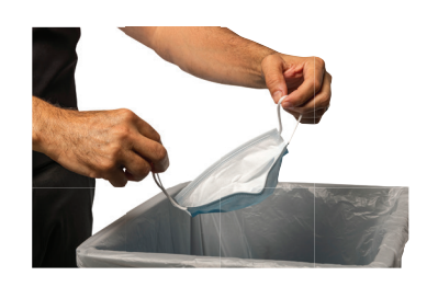
4. Remove your mask and place in trash can.