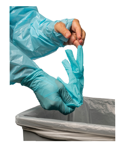
1. Remove your gloves and place in trash can. Clean your hands with hand sanitizer.

This should be removed in the doorway before exiting the patient room.