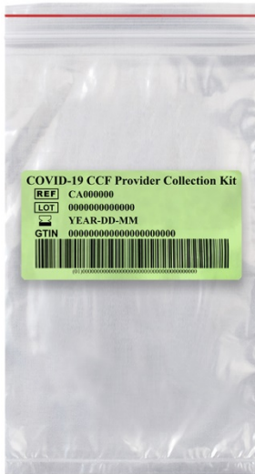
Green labeled bag

COVID-19 CCF Provider Collection Kits are now available to order from Lawson. Whenever possible, please order these kits instead of the blue top Cleveland Clinic Pharmacy saline tubes.