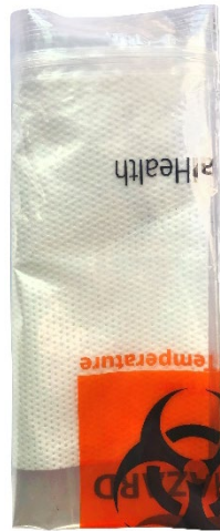
Folded biohazard bag & absorbent sheet (leave sheet in bag)