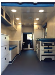
Mobile Integrated Healthcare Unit interior

In an effort to provide innovation and greater access to premier medical care, Cleveland Clinic Florida has created a mobile patient exam room. In a partnership, the Coral Springs and Parkland Fire Departments and Cleveland Clinic Florida developed the Mobile Integrated Healthcare Program (MIH) as an innovative system of care to provide patients in non-emergent situations the option of being treated at the point of contact and then referred to the right location for the appropriate level of follow-up care.