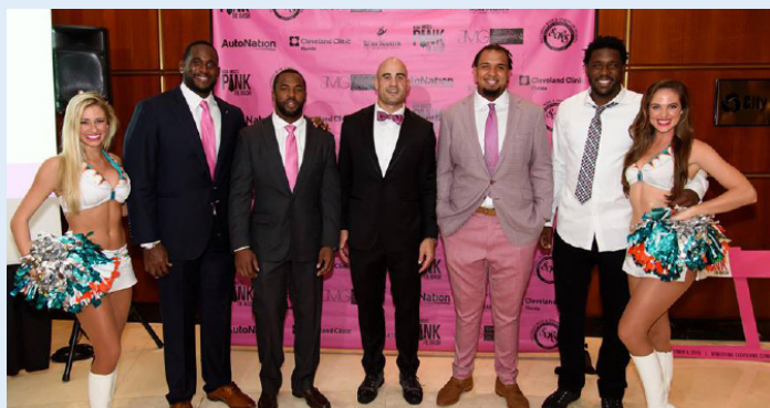
Pink Tie Bash featured a number of Miami Dolphin Players

Throughout the year, members of the President's Circle will be recognized for their support with the Honor Roll of Donors, receive updates through the Florida Focus newsletter and special Cleveland Clinic communications, and invitations to exclusive events. For more information on how you can make a gift and become a member, please contact the Philanthropy department at 954.659.6238.