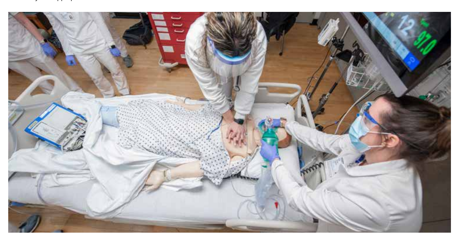
A Code Blue simulation with a manikin reinforces knowledge gained during school. Focusing on patient assessment skills, problem-solving techniques and technical skills in a safe environment helps close the new-nurse competency gap.

The Problem-Recognition Workshop's immersive, generative environment places nurses with peers of similar abilities to build confidence and competence in a nonthreatening, supportive atmosphere. Participants describe feeling completely comfortable asking questions in their small peer groups. The workshop helps nurses